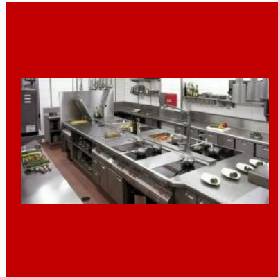
Commercial Kitchen Equipment