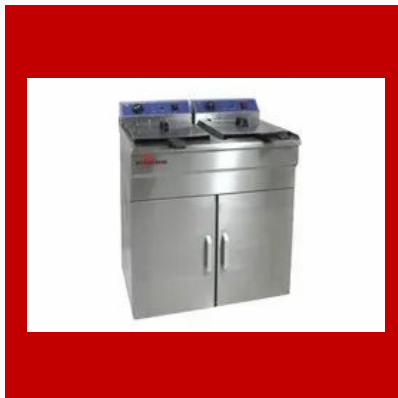
Floor Model Electric Deep Fryer