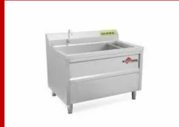
Ozone Bubble Vegetable Washer