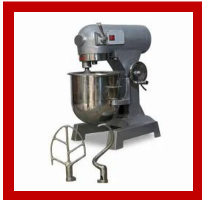
Planetary Mixer Machine