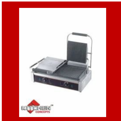
Commercial Double Sandwich Griller