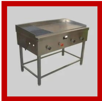
Chapati Plate Cum Puffer