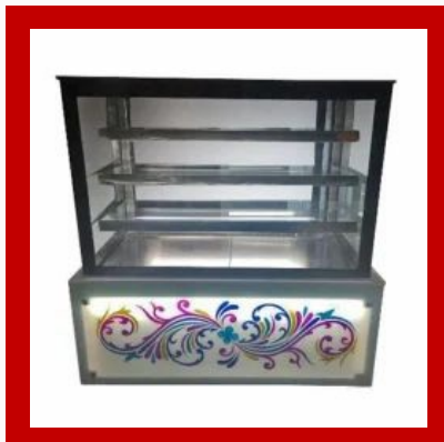
Pastry Display Counter