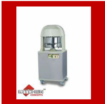
Dough Divider Machine