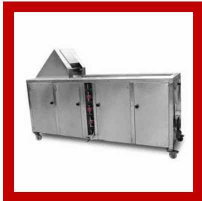
Fully Automatic Chapati Machine