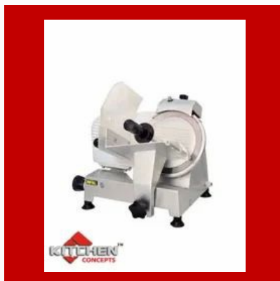
Electric Meat Slicer, 400 mm