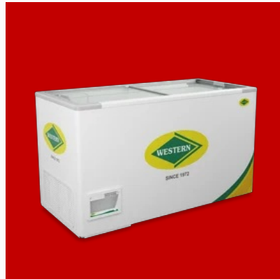
425 L Glass Top Freezer