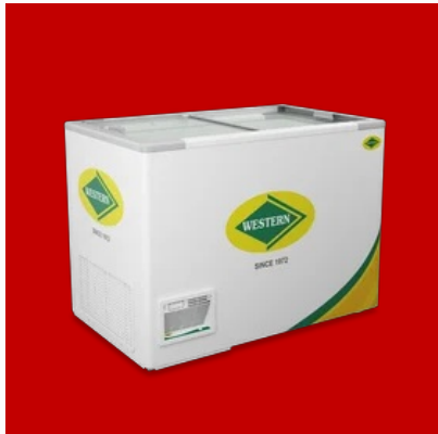
325 L Glass Top Freezer