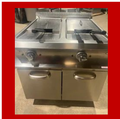
Single Deep Fat Fryer With Dumping