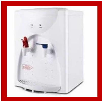
HOT & COLD WATER DISPENSER