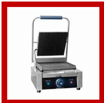
Commercial Single Sandwich Griller