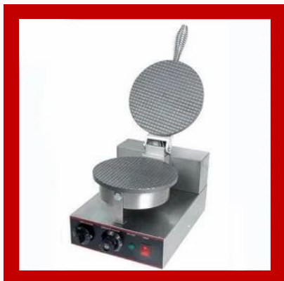
Single Waffle Cone Maker