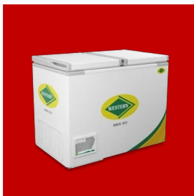
325 L Deep Freezer & Chest Freezer