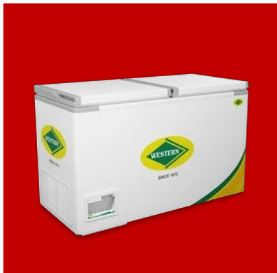
425 L Deep Freezer & Chest Freezer