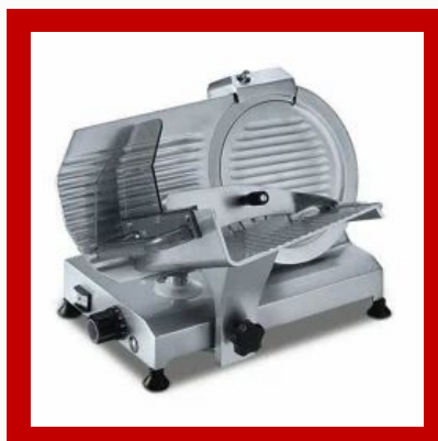
Electric Meat Slicer, 300 mm