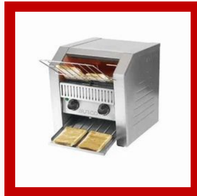
Electric Conveyor Toaster Machine