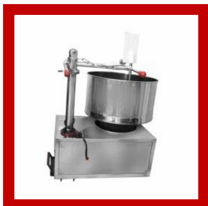
Electric Wet Grinder