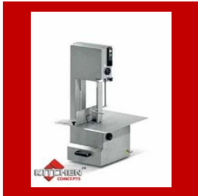
Electric Bone Saw Machine