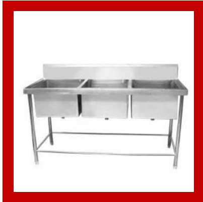
Three Sink Unit