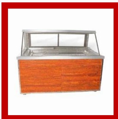
Cold Display Counter