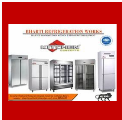
Double Door Refrigerator