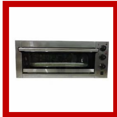
Single Deck Oven