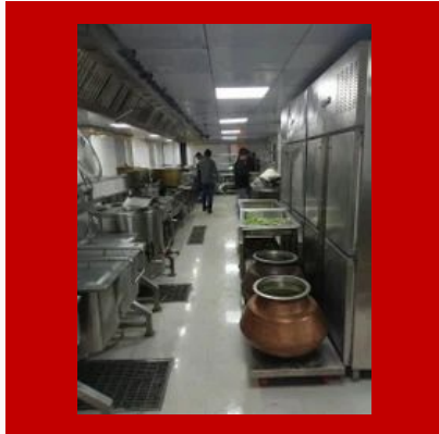
Hospital Canteen Consultant