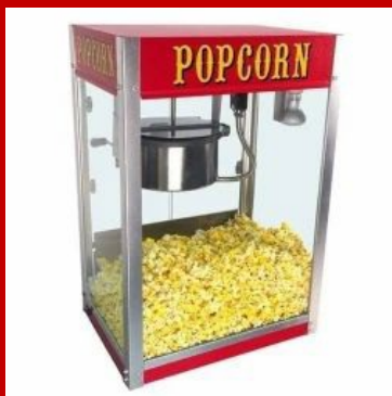
Popcorn Packing Machine