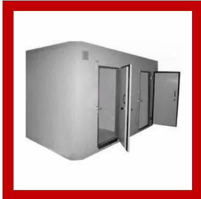
Walk In Freezer