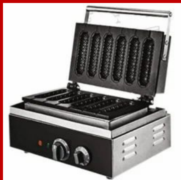
Stick Waffle Baker