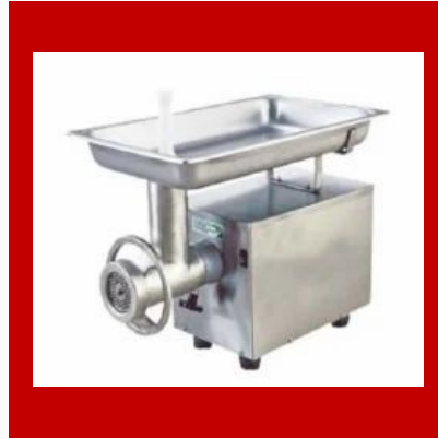
Meat Mincer KC-106MM