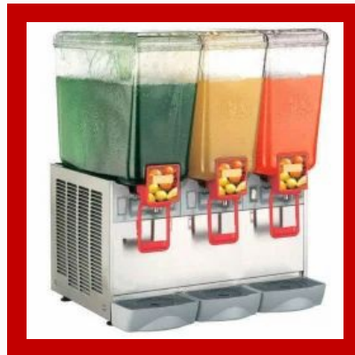
Three Jar Juice Dispenser