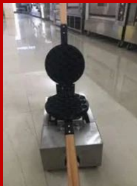
Bubble Waffle Baker