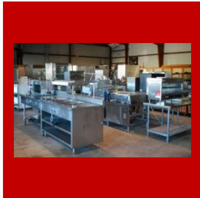
Bar Kitchen Equipment