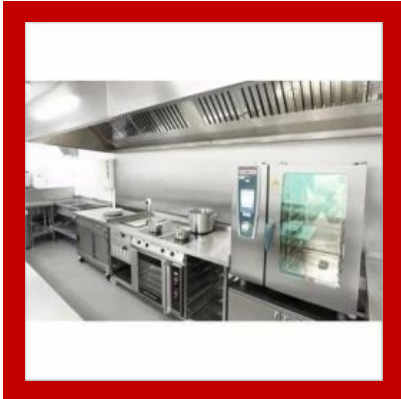
Commercial Kitchen Designer