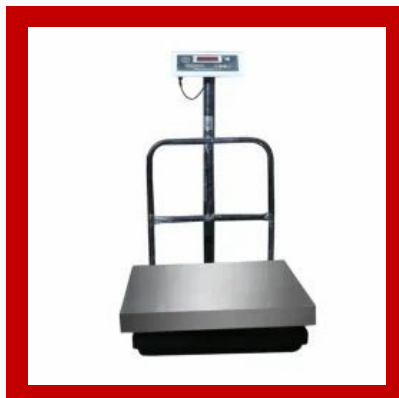
Electronic Weighing Scales