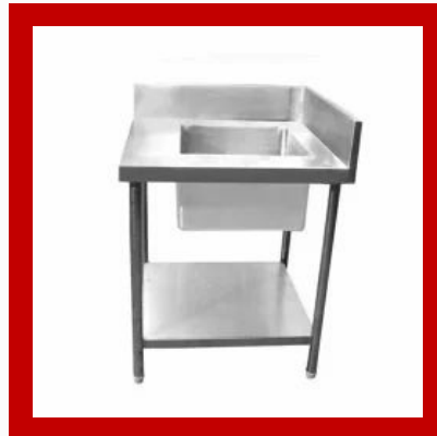
Single Sink Unit