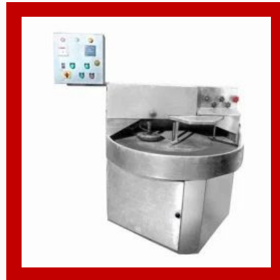
Semi Automatic Chapati Machine