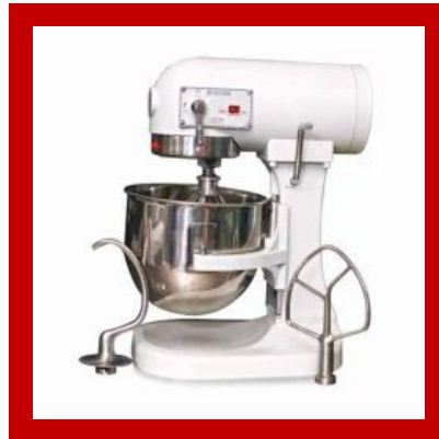
Planetary Mixer Machine