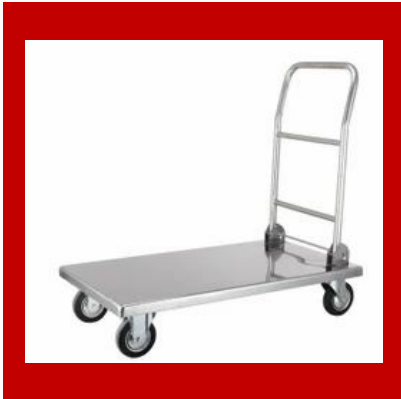
SS Platform Trolley