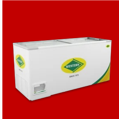
525 L Glass Top Freezer