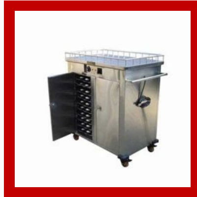
Electric Hot Food Service Trolley