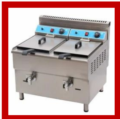
Double Tank Gas Deep Fryer