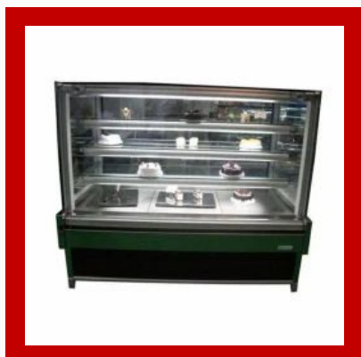
Sweets Display Cabinet