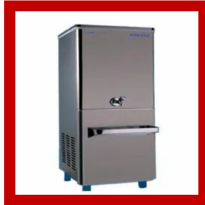
Voltas Water Cooler