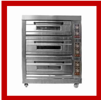
Electric Three Deck Oven