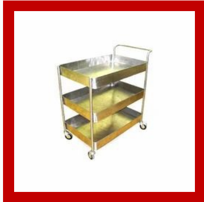
Chapati Collection Trolley