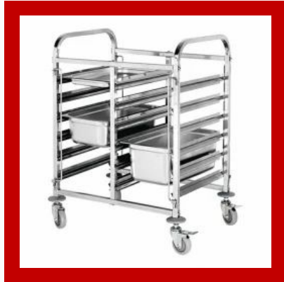
Rack Serving Trolley