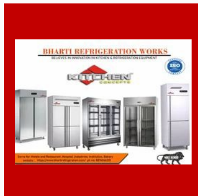
Four Door Vertical Refrigerator