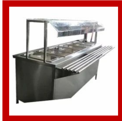
Hot Bain Marie With Sneeze Guard