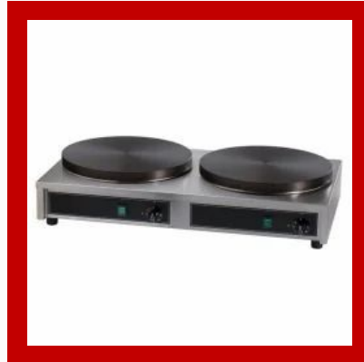
Electric Double Plate Crepe Maker