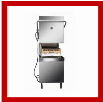
Hood Type Dishwasher