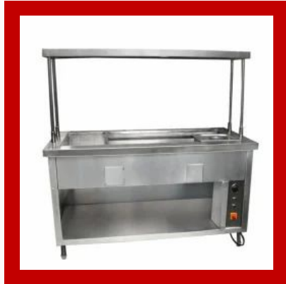
SS Hot Bain Marie