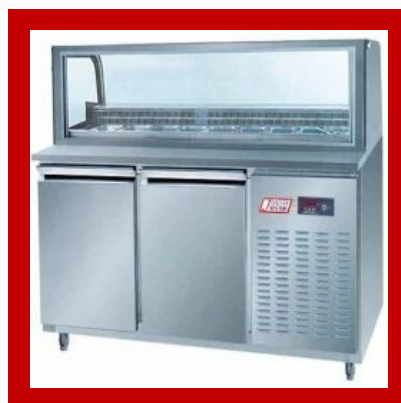
Salad Bar Counter Refrigerator