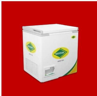
225 L Deep Freezer & Chest Freezer