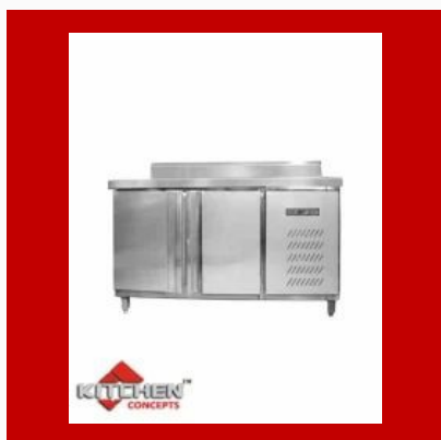
Under Counter Refrigerator