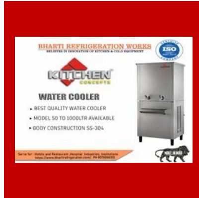
Two Door Glass Chiller