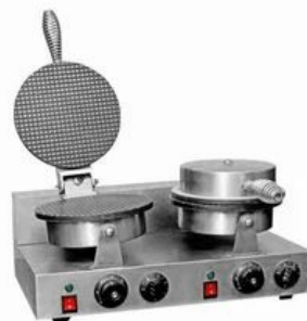
Electric Double Waffle Maker