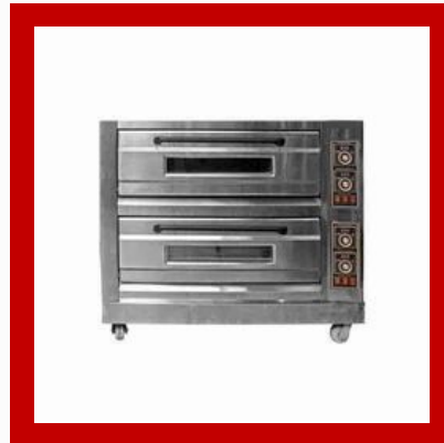
Electric Double Deck Oven