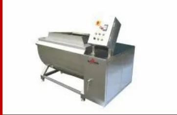
Tilting Vegetable Washer