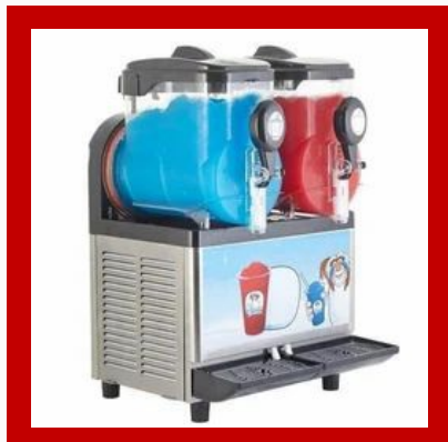
Double Jar Juice Dispenser Machine