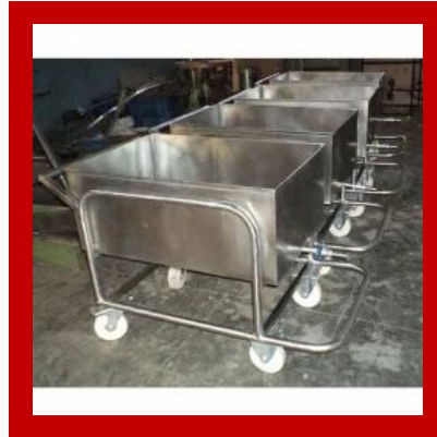
Plate Serving Trolley