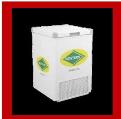
125 L Deep Freezer & Chest Freezer