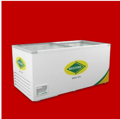
825 L Glass Top Freezer