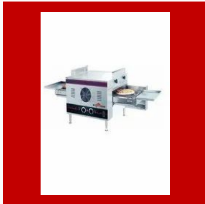
Electric Conveyor Pizza Oven