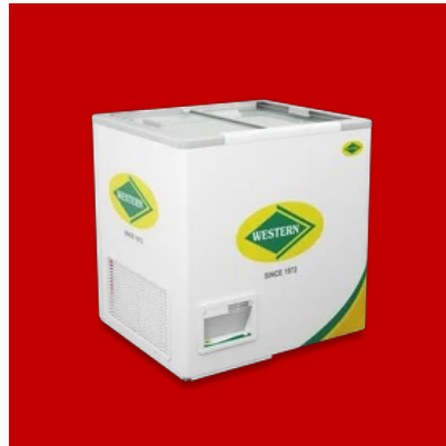
225 L Glass Top Freezer