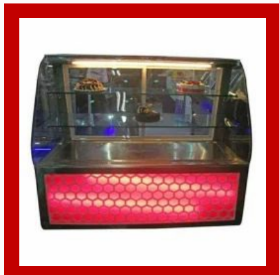
Cake Display Counter