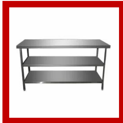
SS Work Table