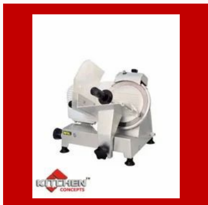
Electric Meat Slicer