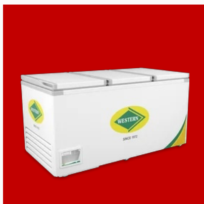
825 L Deep Freezer & Chest Freezer