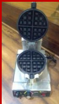
Rotary Waffle Maker