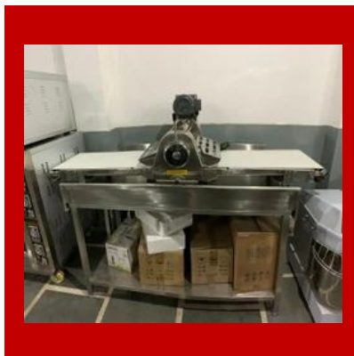
Table Top Dough Sheeter