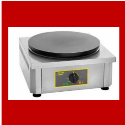
Electric Single Crepe Maker